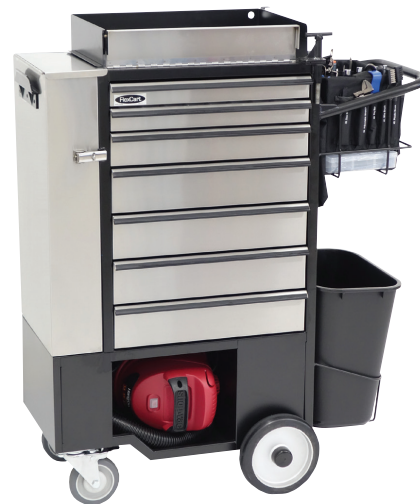
Engineering Cart with tools included 0037300

Utilizing the Flexcart throughout all your facilities creates a powerful new standard that is efficient, professional and predictable and will perpetually benefit your business.